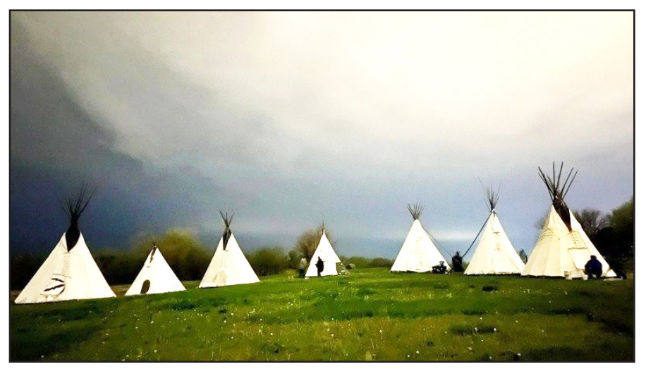
Fourteen days ago under cover of darkness, we raised seven tipis on Snell Hill and established the Niskíthe Prayer Camp. With those lodges, we stated unequivocally that we will not tolerate erasure in our city government, and we will not accept exclusion from conversations that impact our sacred ceremonial sites. With our camp, we declared we are still here, we are strong, we will remain.