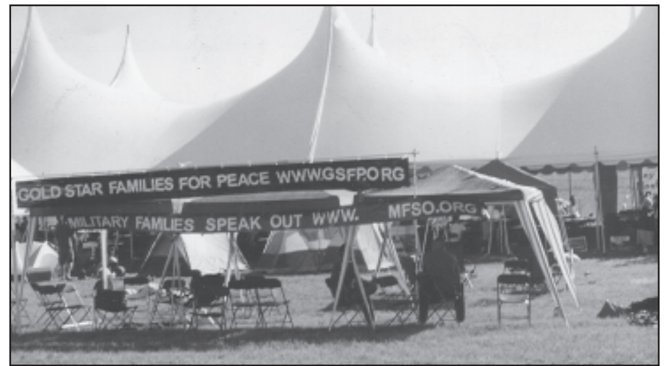
“Camp Casey 1” outside the “Western White House” in Crawford, Texas