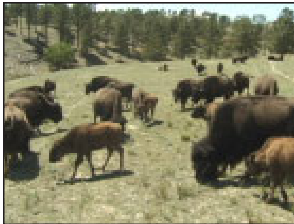
The Merrival Ranch buffalo herd to which Rainbow & Medicine Wheel were born.

The next day, the beautiful holy woman came to the scouts' camp and gave the People the Sacred Pipe. She taught them how to pray with it and told them how to live virtuously with the four great virtues: courage, wisdom, generosity and fortitude. She also gave