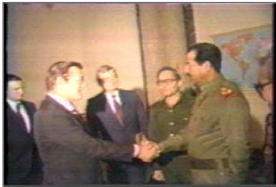
In 1983, Iraqi television caught Reagan Administration envoy Donald Rumsfeld (the current Secretary of Defense) meeting with key U.S. ally Saddam Hussein in Baghdad.

July 17, 1968 – Baathists and army officers overthrow regime. "Again, this coup, amid more factional violence, came with C.I.A. backing. Serving on the staff of the National Security Council under Lyndon Johnson and Richard Nixon in the late 1960s, I often