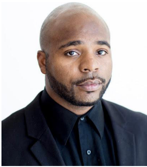
Senator Terrel McKinney