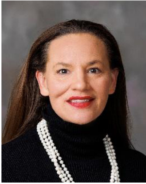
Senator Danielle Conrad