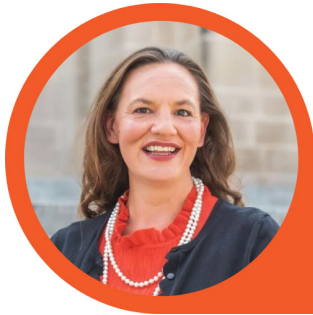
Senator Danielle Conrad