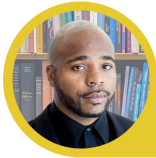
Senator Terrell McKinney