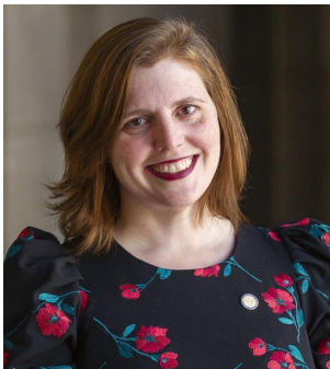
Senator Machaela Cavanaugh