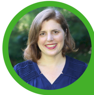
Senator Machaela Cavanaugh