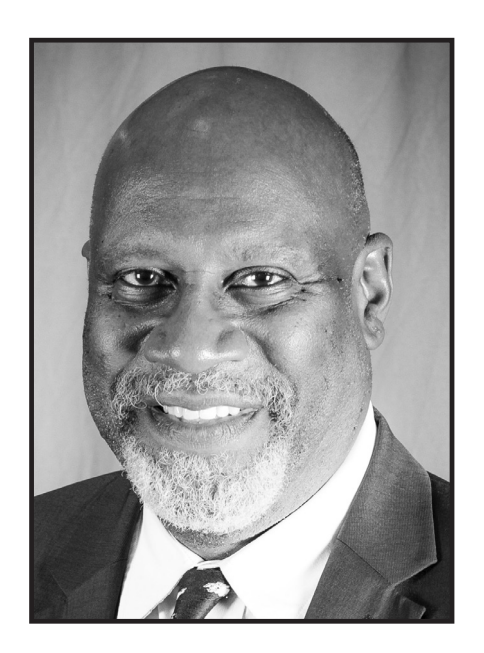
by A'Jamal-Rashad Byndon

During the past year, I have encountered many parodies and anomalies affecting low-income, communities of color. Taken as a whole, it is apparent we have the blind leading the blind. How is it, otherwise, that despite over 400 years of slavery and oppression in the United States we have so little to show for our efforts? For any demographic you look at (you pick-education, the criminal justice system, healthcare, housing, employment, whatever), it's clear that too many are stuck on stupid. If you follow the data or keep your eyes on the prize, you would think something in the way of change should be forthcoming. But that's not going to happen if the oppressor is playing the white shell game.