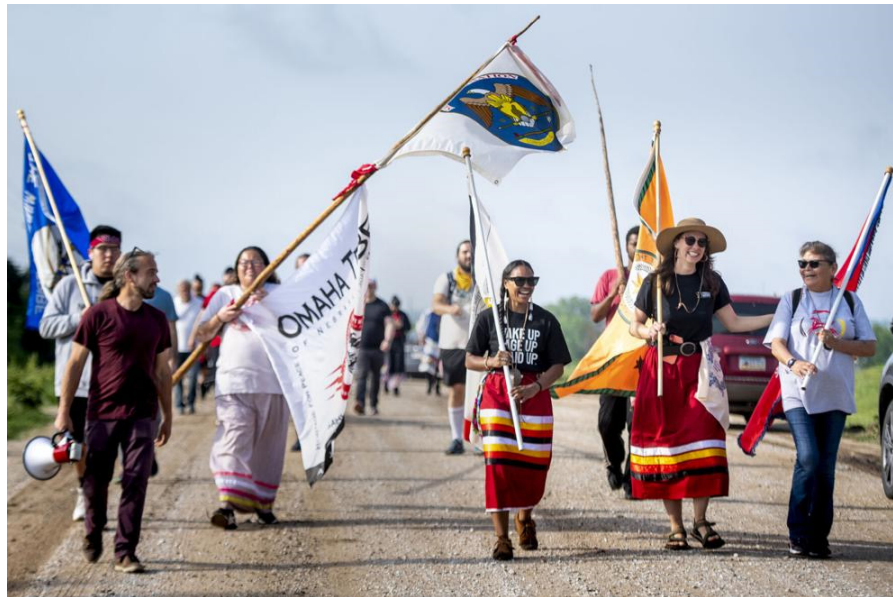
Four prayer walk on August 22, 2022.

One week after that decision, dawn rose on Snell Hill, illuminating seven tipis that had been erected overnight. Niskithe Prayer Camp was established, and with our presence